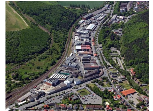
TANIJOBIS Goslar site in Niedersachsen